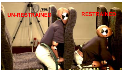
5 th Percentile Neck Bending (note: seat flexes to cushion impact)

2. Accident analysis shows that fatalities predominantly arise from either ejection or loss of survival space due to structural intrusion. A comparison was therefore drawn between: