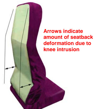
Typical Seat Deformation due to Unrestrained Passenger Knee Intrusion