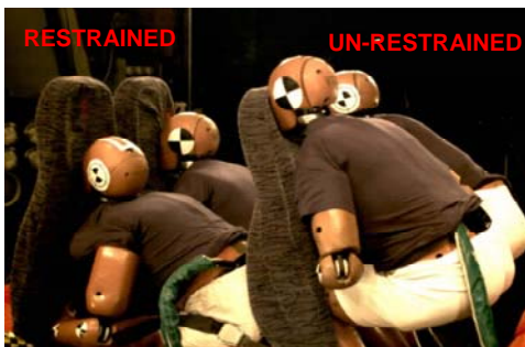
95 th Percentile Neck Bending